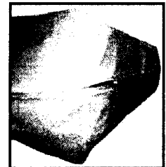
A zippered bed bug proof cover can help protect against